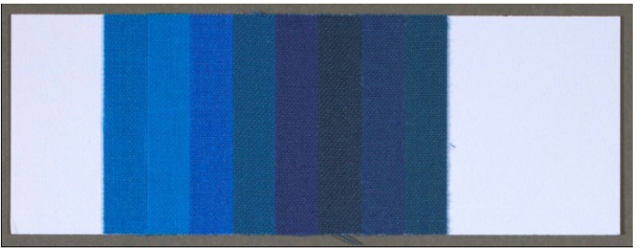
Blue Wool Card

To demonstrate the degree of fading caused by the intensity of light in a particular location, cover half of the card with a lightblocking material to protect it completely from light damage (or cut the card into strips and reserve one as a control). Note the date and set out the Blue Wools in the desired location. Check periodically (every few weeks) to determine how long it takes the various samples to fade. Since the sensitivity of the first few samples on the card corresponds to light sensitive materials such as watercolors and textiles, the results will give you a general idea of the amount of damage you might expect if materials were exhibited for the same period of time at the current light level in that location.