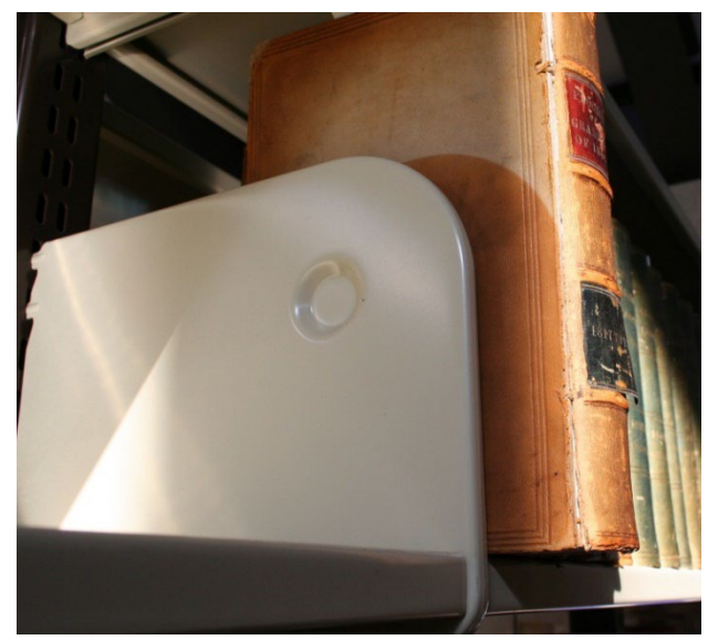
Light damage to leather binding

Molecules, the basic chemical building block of all materials, are in constant motion. On the electromagnetic spectrum, as the wavelengths get shorter, the potential energy increases. When this energy is introduced to the molecules, they vibrate more quickly (they get "excited") and begin to spread out. Thus, wavelengths that are short (e.g., those from the ultraviolet portion of the spectrum) will increase the vibration of the molecules and encourage them to expand, then cleave, and bond again, which leads to the deterioration of plant and animal fibers. In addition, this re-bonding can change the way that visible light interacts with the material, causing a change in the wavelength of the light and, as a result, we are shown a different color. For example, as a book with a dyed leather cover sits in the sunlight at the end of a shelf, the light causes the molecules in the dye to vibrate more quickly, bump against each other, and change their shape. The light hitting and reflecting off these new molecules changes the speed of the wavelength and thus the color the eye perceives in relation to the dye changes. The general term for this process is photochemical deterioration.