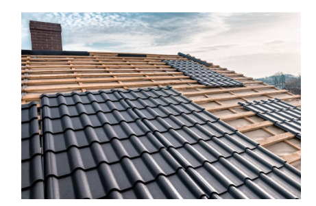
Adding noncombustible roof coverings can help protect roofs from wildfires.