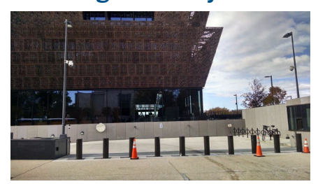
A self-rising flood barrier protects structures by automatically raising the barrier when floodwaters rise.