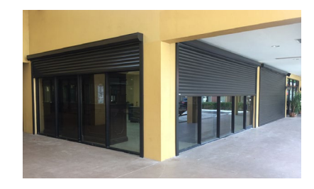
Adding hurricane shutters protects windows against flying debris during high wind events such as hurricanes, tropical storms, or severe storms.