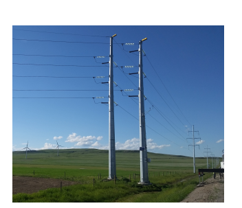
Replacing power poles with higher-rated poles prevents future damage.