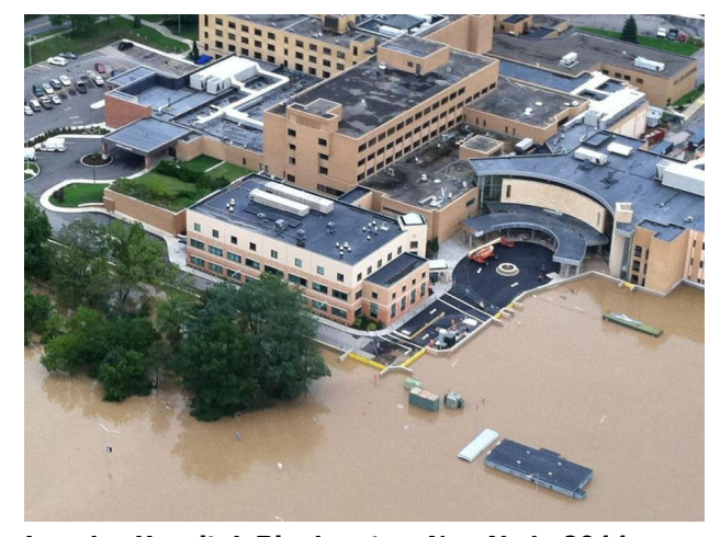
Lourdes Hospital, Binghamton, New York, 2011

FEMA evaluates proposed PA Mitigation measures for four main factors: risk reduction, cost-effectiveness, technical