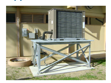
An elevated heat pump is an example of elevating equipment to prevent flooding damage.