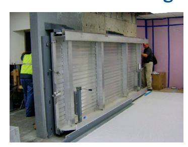
A flood door is an example of dry floodproofing a building.