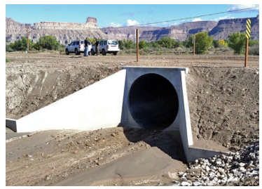
To prevent flooding and erosion this culvert was replaced with a larger culvert and additional wingwalls.